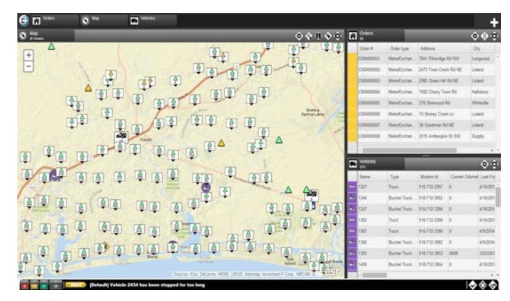
Rich, geo-spatial view of smart meters, vehicles and service work.

BEMC began to make some preliminary determinations on how to manipulate and present AMI data in a more intelligent, consumable format. The utility also began to research the approaches of peer companies. At industry conferences, when BEMC did manage to encounter a utility that had something in place, it was exclusively a home-grown system comprised of one or more SQL servers. While the server(s) did house the data in a central location, it was still an exercise to try to manipulate it to support timely and informed decision-making. For 3-4 months, BEMC continued to scope out requirements and investigate what other utilities were doing before the project team was introduced to Clevest.